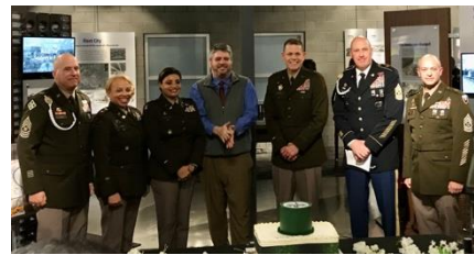
Army Leadership at 80 th Anniversary of Camp Parks

Our nearest military installation, Parks Reserve Forces Training Center, aka Camp Parks, celebrated its 80 th Anniversary this month with leadership from the Parks installation, Ft Hunter Liggett, and the 63 rd Readiness Division on hand to recognize contributions of the Soldiers,