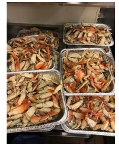
Delicious Crab table ready

Looking ahead, we are exploring more social activities for a good cause which will appeal to members and the public alike. Get ready for a good-time Poker Tournament and/or a hotly contested Chili Cook-Off. Never underestimate the ability of a good poker hand or a steaming bowl of chili to lift your spirits and your outlook. Hope to see you at our next meeting, February 1 st at 6:00