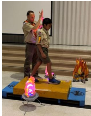
Bridging to new adventures.

Every year I have the pleasure of attending the Cub Scout Blue and Gold ceremony. Each of our Cub Scout packs celebrates the creation of Cub Scouts within the Boy Scout system. The Cub Scouts were created in February 1930 approximately one decade after the creation of Boy Scouts of America. It was intended primarily to introduce young children into the joys of outdoor scouting and as a method for