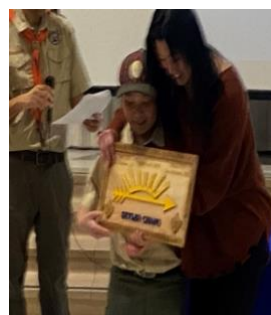
Happy Scout earns Arrow of Light.

Assistant Adjutant is an easy entry position for anyone with no adjutant experience. In practice, the adjutants and assistant adjutants keep our admin house in order including membership, minutes, and more.