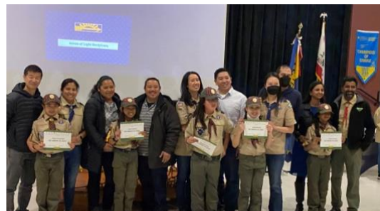
Smiles galore at the Blue and Gold!