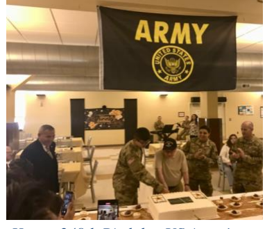
Happy 248th Birthday US Army!

month, our Post has been involved in several rewarding activities and events: from hosting a Women Veterans